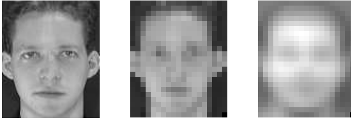
Fig. 1. A face image of subject No.1 (left), its compressed form by local average using a 5 \times 5 window (middle) and the average face over all the 5 \times 40 compressed facial images (right).

sets, with 5 images of each person used for training and the remaining 5 for testing. A different eigenface module which was trained by the respective face images was set up for each person.