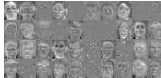
Fig. 4. 40 parallelly computed, reconstructed faces when a testing face from subject 1 is presented to the modular system.

The process of identifying a face is demonstrated further in Figure 4 when a testing face of subject No.1 is presented to the modular recognition system.